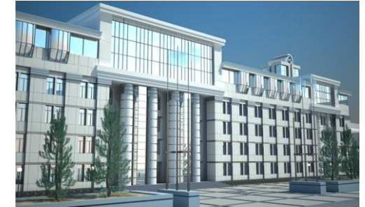
ChelPipe, Chelyabinsk, Russia